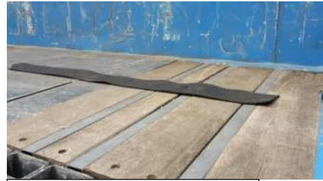
First position the anti slip mats